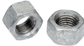
HOT DIP GALVANIZED