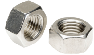
STAINLESS STEEL TYPE 18-8